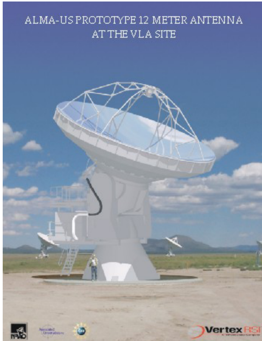
Figure 2. An engineering rendering of the 12 meter diameter prototype antenna that is being fabricated by VertexRSI to the very demanding ALMA specifications. The prototype antenna is under construction at the NRAO Very Large Array site for testing, as shown in this drawing.